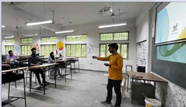
Studios with Projectors