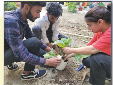
Plantation by Students