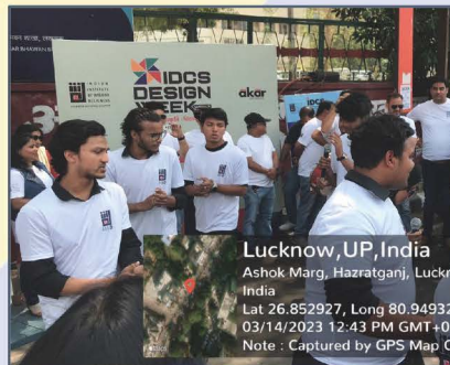
Nukkad Natak by Students