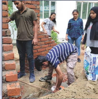
Construction work by students