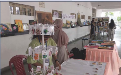
Sale & Exhibition by Students