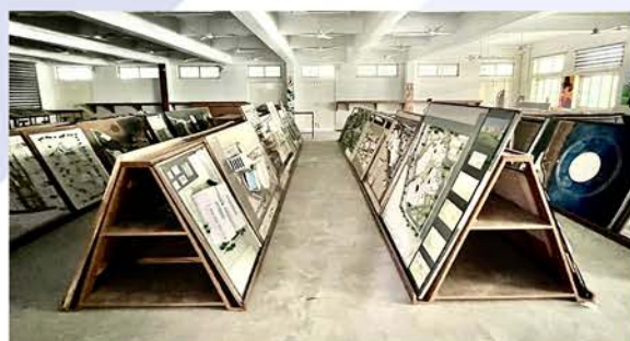
Model Making cum Display Room