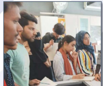
Case study of Modular Kitchen