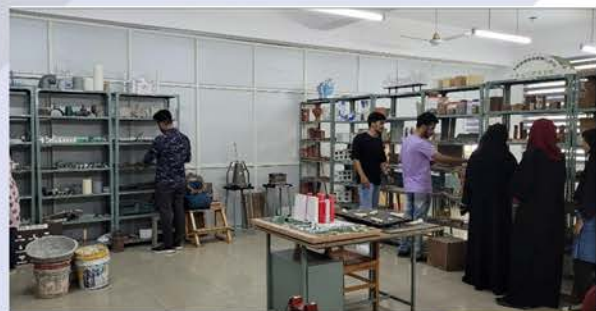
Material and Surveying Lab