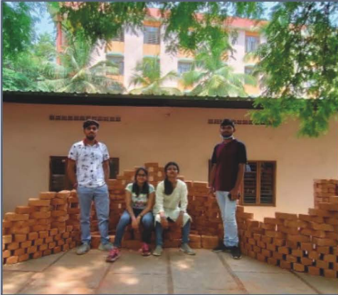
Brick workshop at AKTU