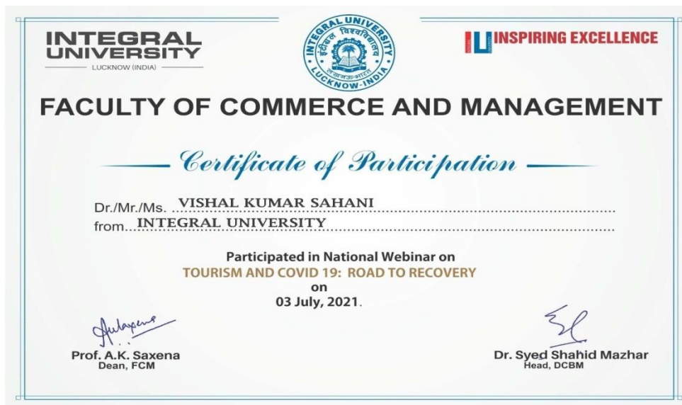
Webinar Certificates distributed to the Participants