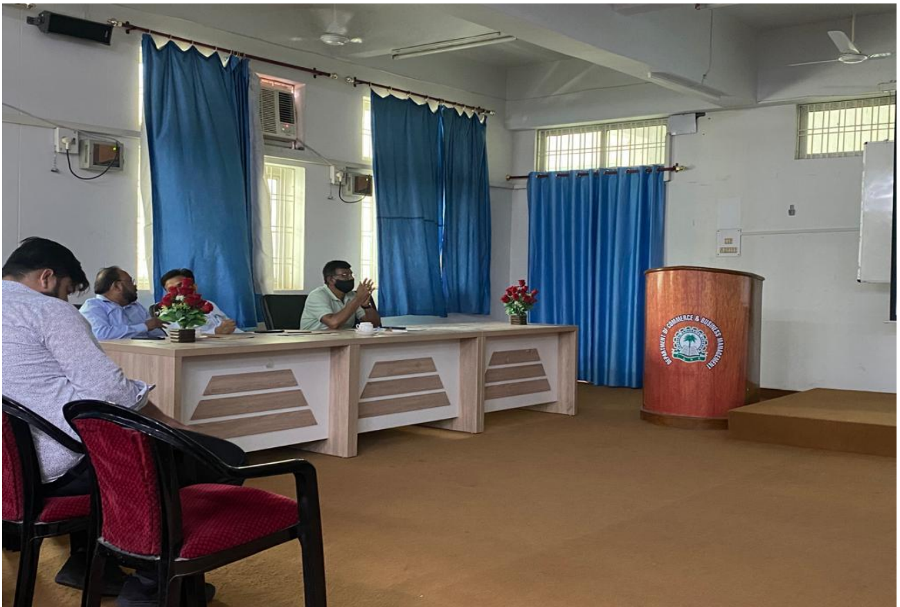
Panel of judges witnessing the performances