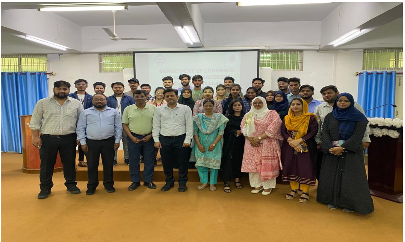
Faculty members with the winners and the organizing team