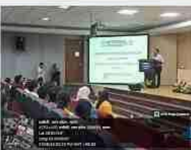
Dashauli, Uttar Pradesh, India X352+429, Dashauli, Uttar Pradesh 226026, India Lat 26.957827° Long 80.999971° 01/08/24 01:30 PM GMT +05:30