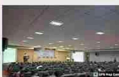
Dashauli, Uttar Pradesh, India X352+429, Dashauli, Uttar Pradesh 226026, India Lat 26.957827° Long 80.999971° 01/08/24 01:46 PM GMT +05:30