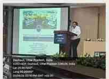
Dashauli, Uttar Pradesh, India X352+429, Dashauli, Uttar Pradesh 226026, India Lat 26.957827° Long 80.999971° 01/08/24 02:16 PM GMT +05:30