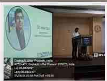
Dashauli, Uttar Pradesh, India X352+429, Dashauli, Uttar Pradesh 226026, India Lat 26.957827° Long 80.999971° 01/08/24 02:48 PM GMT +05:30