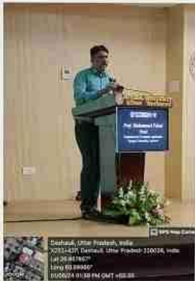
Dashauli, Uttar Pradesh, India X352+429, Dashauli, Uttar Pradesh 226026, India Lat 26.957827° Long 80.999971° 01/08/24 01:30 PM GMT +05:30