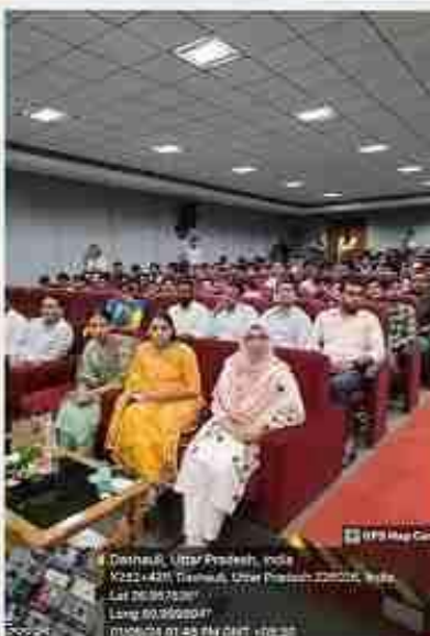
Dashauli, Uttar Pradesh, India X352+429, Dashauli, Uttar Pradesh 226026, India Lat 26.957827° Long 80.999971° 01/08/24 01:46 PM GMT +05:30