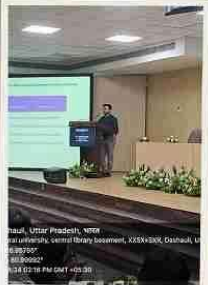
Dashauli, Uttar Pradesh, India Integral university, central library basement, XX5X+3KR, Dashauli, Uttar Pradesh 226026, India Lat 26.957827° Long 80.999971° 01/08/24 02:16 PM GMT +05:30