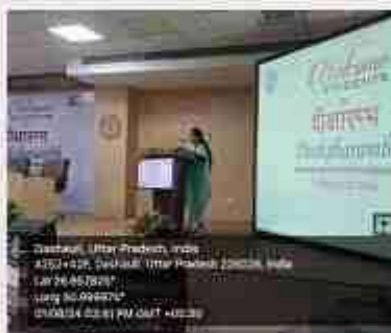
Dashauli, Uttar Pradesh, India X352+429, Dashauli, Uttar Pradesh 226026, India Lat 26.957827° Long 80.999971° 01/08/24 02:41 PM GMT +05:30