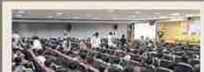
Dashauli, Uttar Pradesh, India X352+429, Dashauli, Uttar Pradesh 226026, India Lat 26.957827° Long 80.999971° 01/08/24 02:48 PM GMT +05:30