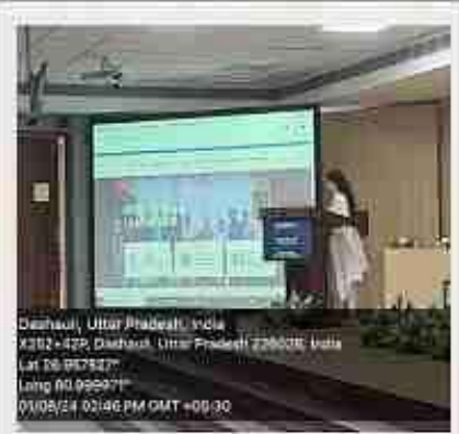
Dashauli, Uttar Pradesh, India X352+429, Dashauli, Uttar Pradesh 226026, India Lat 26.957827° Long 80.999971° 01/08/24 02:46 PM GMT +05:30