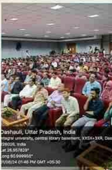
Dashauli, Uttar Pradesh, India Integral university, central library basement, XX5X+3KR, Dashauli, Uttar Pradesh 226026, India Lat 26.957827° Long 80.999971° 01/08/24 01:46 PM GMT +05:30