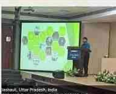
Dashauli, Uttar Pradesh, India X352+429, Dashauli, Uttar Pradesh 226026, India Lat 26.957827° Long 80.999971° 01/08/24 02:48 PM GMT +05:30