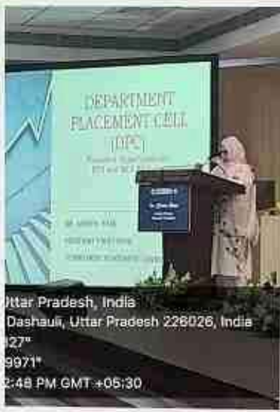
Dashauli, Uttar Pradesh, India Dashauli, Uttar Pradesh 226026, India Lat 26.957827° Long 80.999971° 01/08/24 02:48 PM GMT +05:30