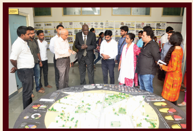
General Berito, Uganda