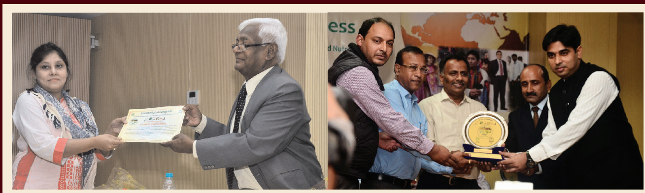
Moments of reward and glory