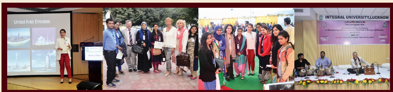
Glimpses of ICBAFM-17