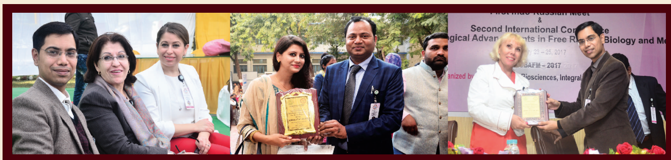
Glimpses of ICBAFM-17