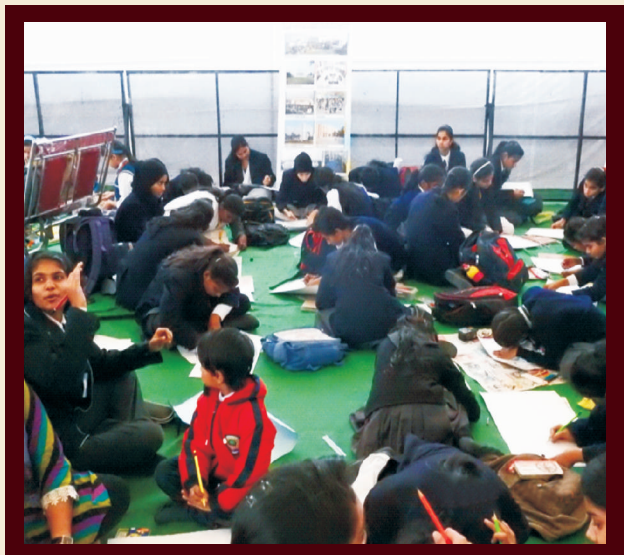
Children busy with on -the- spot painting competition