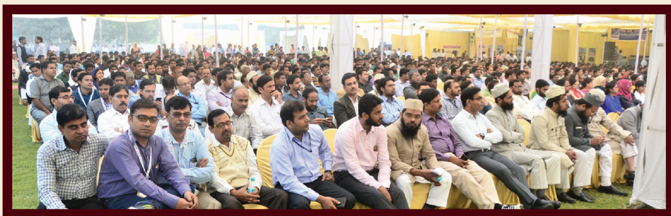
Audience getting benefitted by the words of wisdom