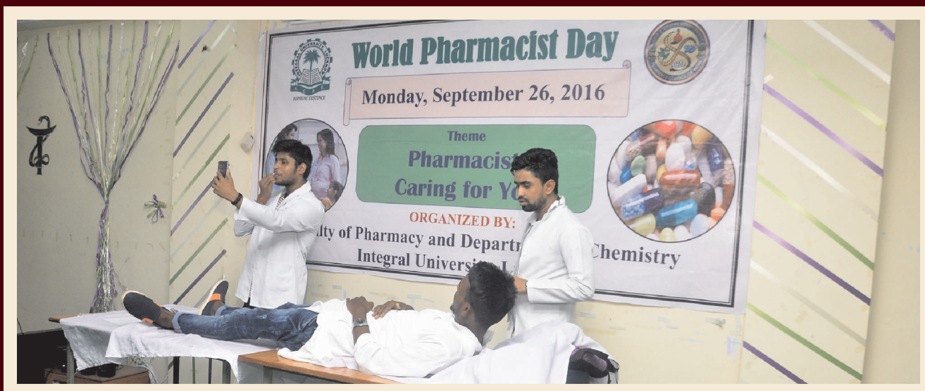
Students presenting a skit based on Dengue-Awareness