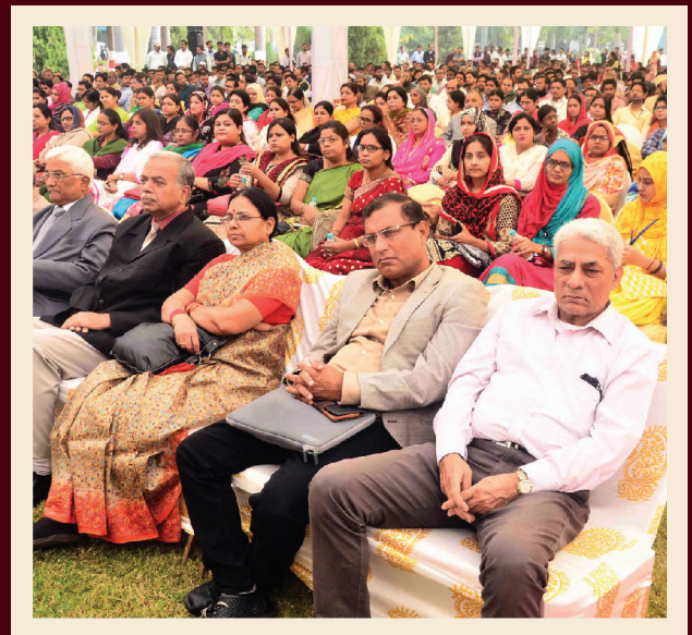
The audience at the inaugural ceremony

Natak on the topic "Ungli Par Tilak". Another excellent act was delivered by 12 Civil Engg. students on "Bebas Kisan". The Technical event, Robo Race, in which students designed the robots for race was impressive. Students drew beautiful designs in Ink - Art competition. A Slogan writing competition in Hindi, English and Urdu was also organized in which participants wrote many creative slogans. A tough competition was seen in Bait Baazi. Students showed their writing skills in Self-Composed Poetry (Hindi, Urdu and English). Andaaz-e-Awadh, the traditional fashion show, saw some high-energy and mind-blowing performances by the participants.