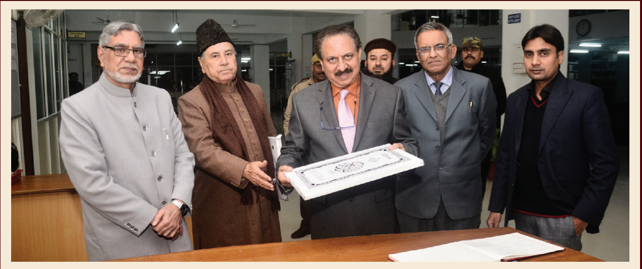
Hon'ble guests in the central library of Integral University