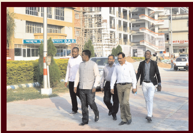
Association of African students in India (AASI) delegation visiting Integral University