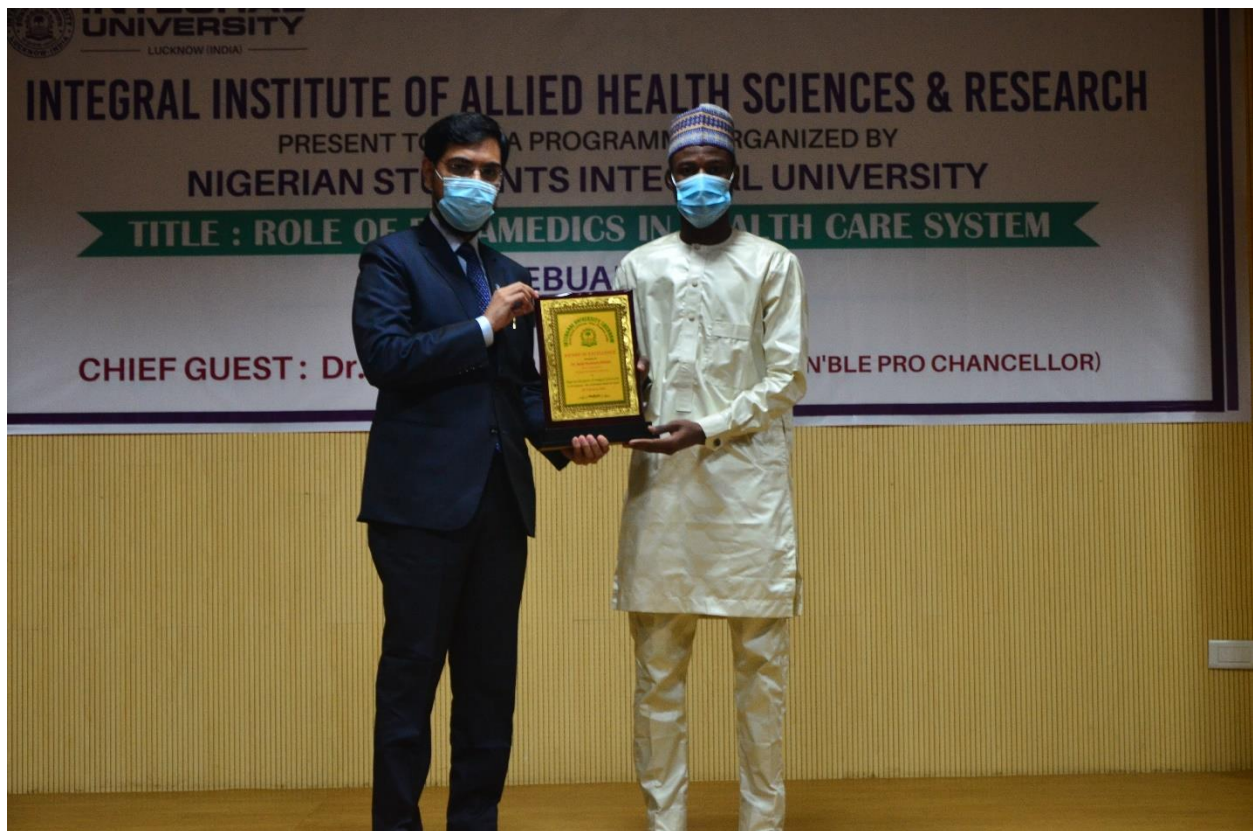
Students and authorities participating in the program of Role of Paramedics in Health Care System