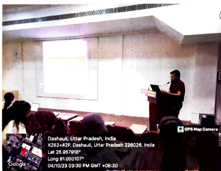
Presentation by Participants

Handwritten signature 4.10.23 Department of Education Head Integral University, Lucknow