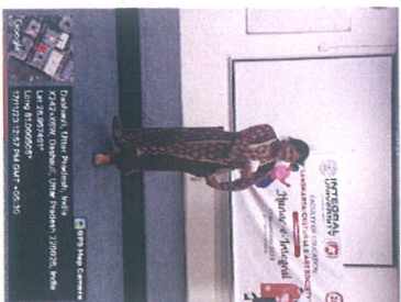
Semi Classical dance performance by the Student

IU Mail - REPORT on HUNAR -E-INTEGRAL Organized by Sanskarya - Culture and Art Society Faculty of Education 17th November 2023