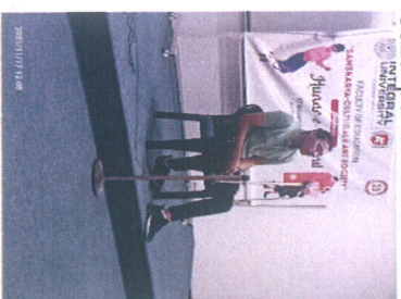
Solo acting by the student

https://mail.google.com/mail/u/0/?ik=acb83c0802&view=pt&search=all&permthid=thred-f:1785426865991743861&siml=msg-f:1785426865991743861