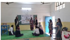
Students of the Faculty of Education at Extension Activity at The Presidency Public School.