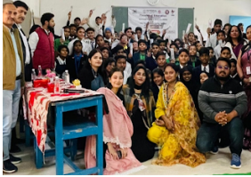
Students performing Skit on Atma Nirbhar Bharat Scheme.