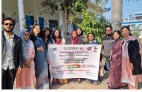
Students at the Campus of The Presidency Public School.