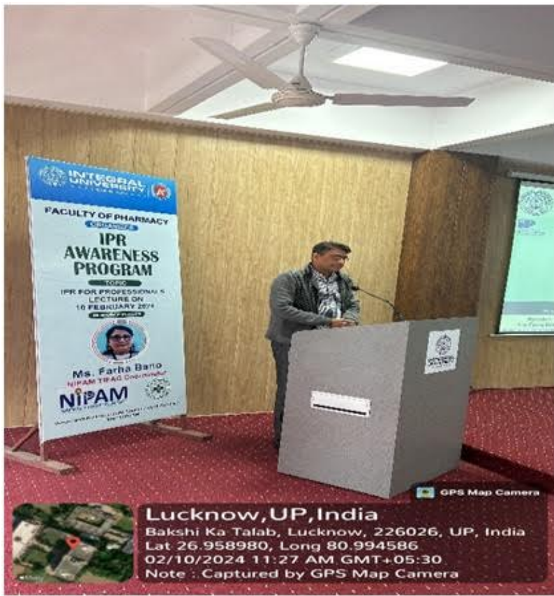
Lucknow, UP, India Bakshi Ka Talab, Lucknow, 226026, UP, India Lat 26.958980, Long 80.994586 02/10/2024 11:27 AM GMT+05:30 Note : Captured by GPS Map Camera