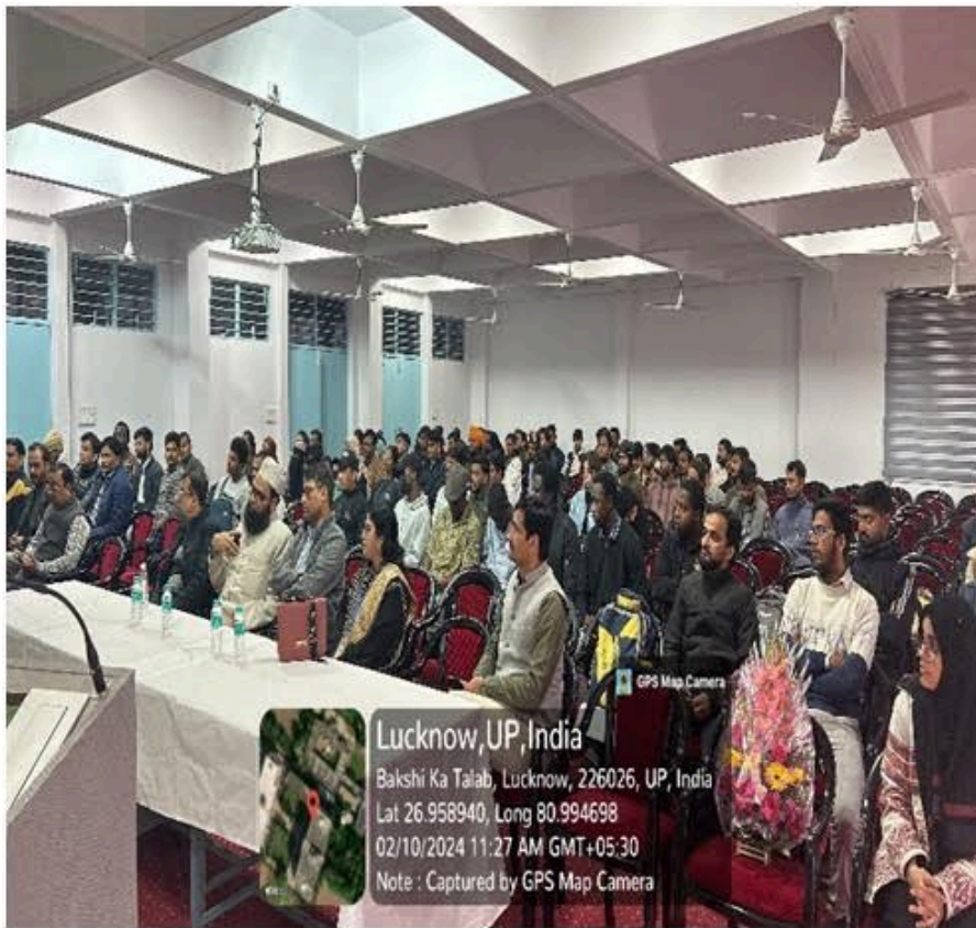
Lucknow, UP, India Bakshi Ka Talab, Lucknow, 226026, UP, India Lat 26.958940, Long 80.994698 02/10/2024 11:27 AM GMT+05:30 Note : Captured by GPS Map Camera