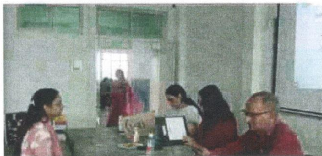
Interview of Students with panel of Experts