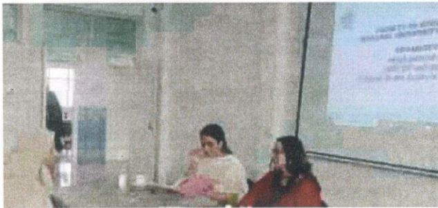
interview by Panelist