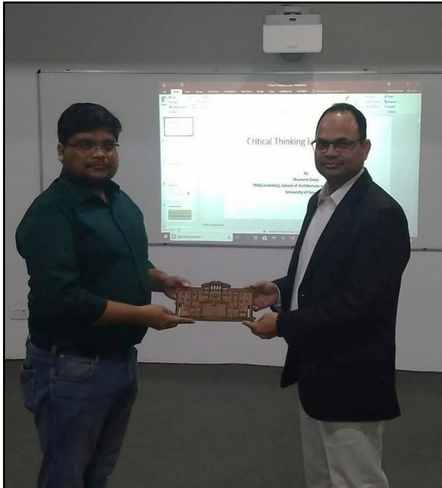
Glimpses of Expert Lecture on “ Research Writing ”