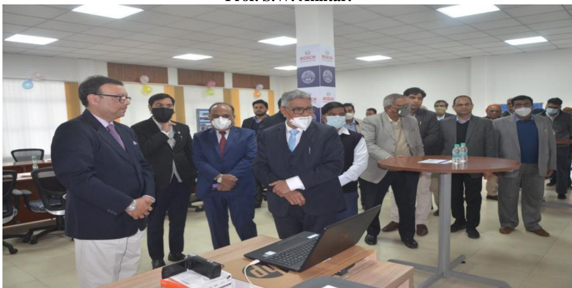
Honorable Chancellor at the Bosch- Integral Collaboration Centre