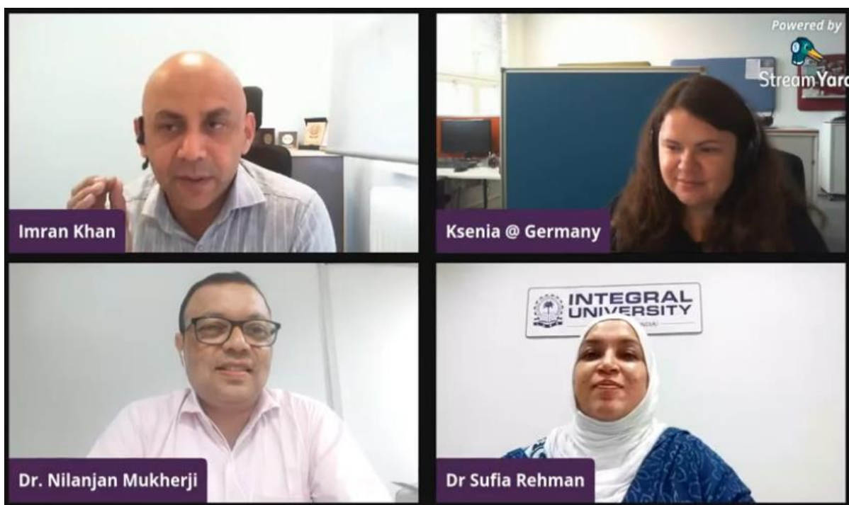
An International Webinar on “Study & Work in Germany”